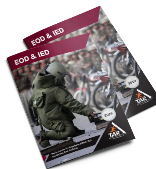
EOD & IED