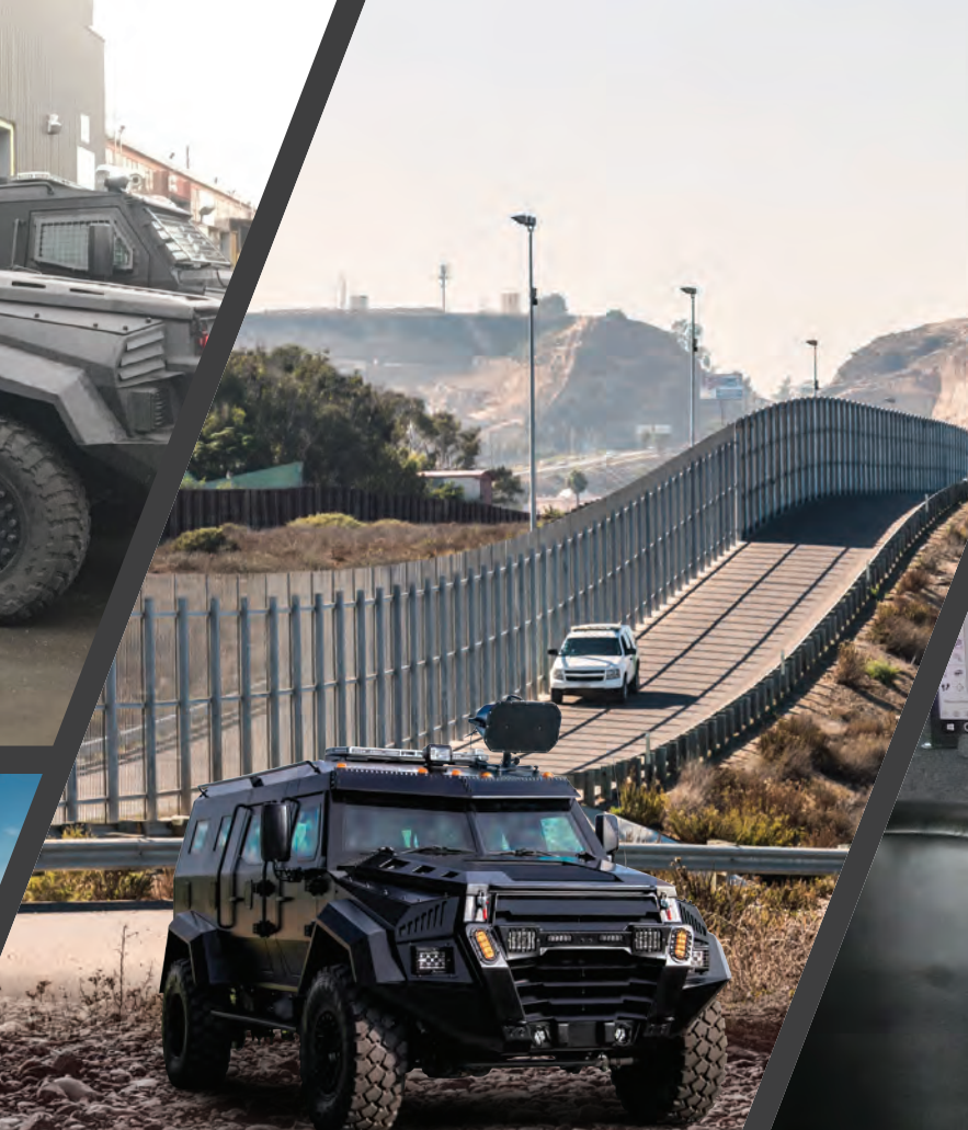
SURVEILLANCE & INTELLIGENCE VEHICLE