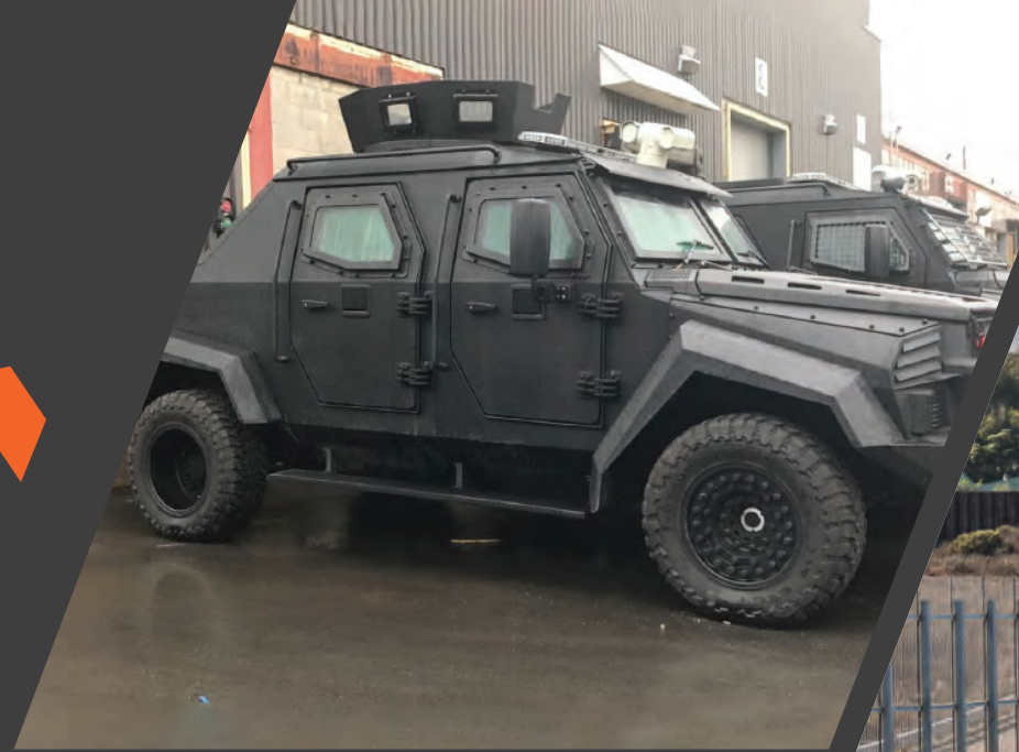
ELECTRONIC WARFARE SYSTEM