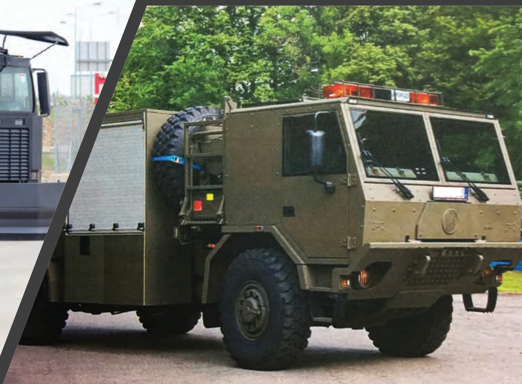
CBRNE FIRST RESPONDERS LAB