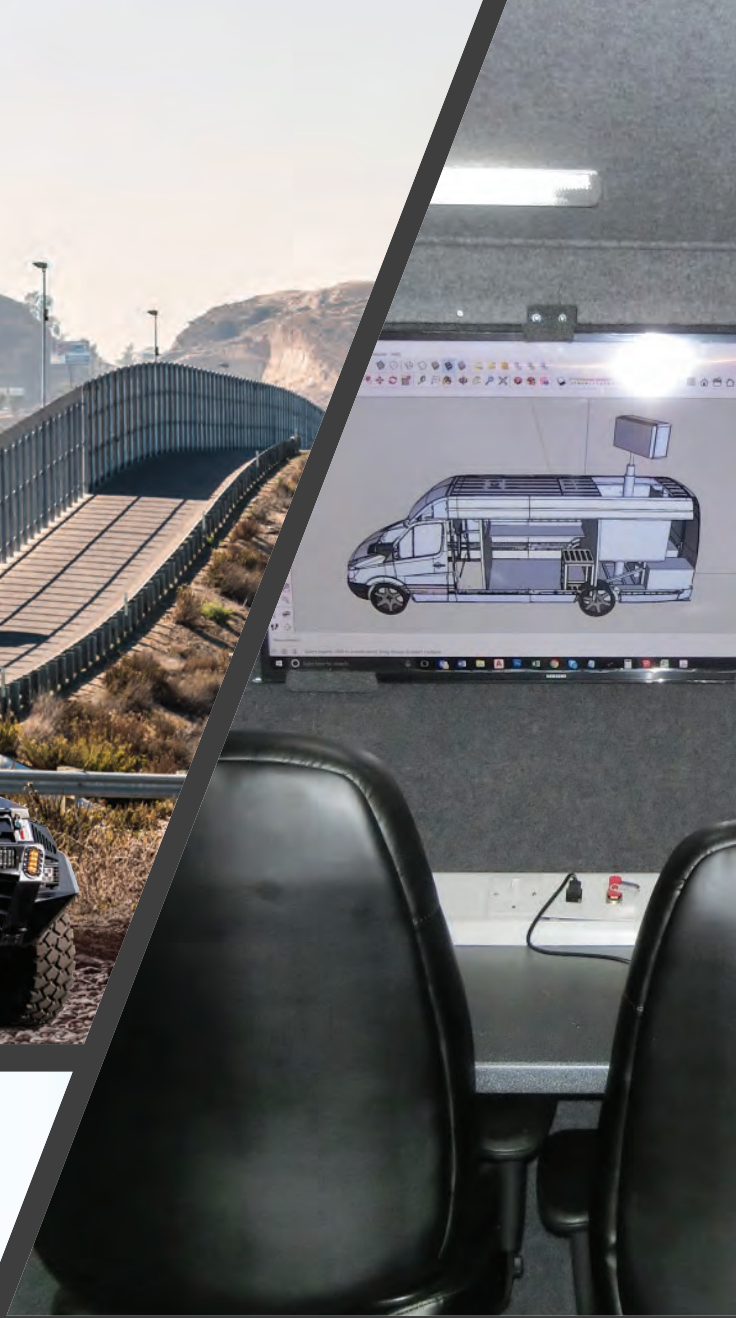
POLICE PATROL VEHICLE