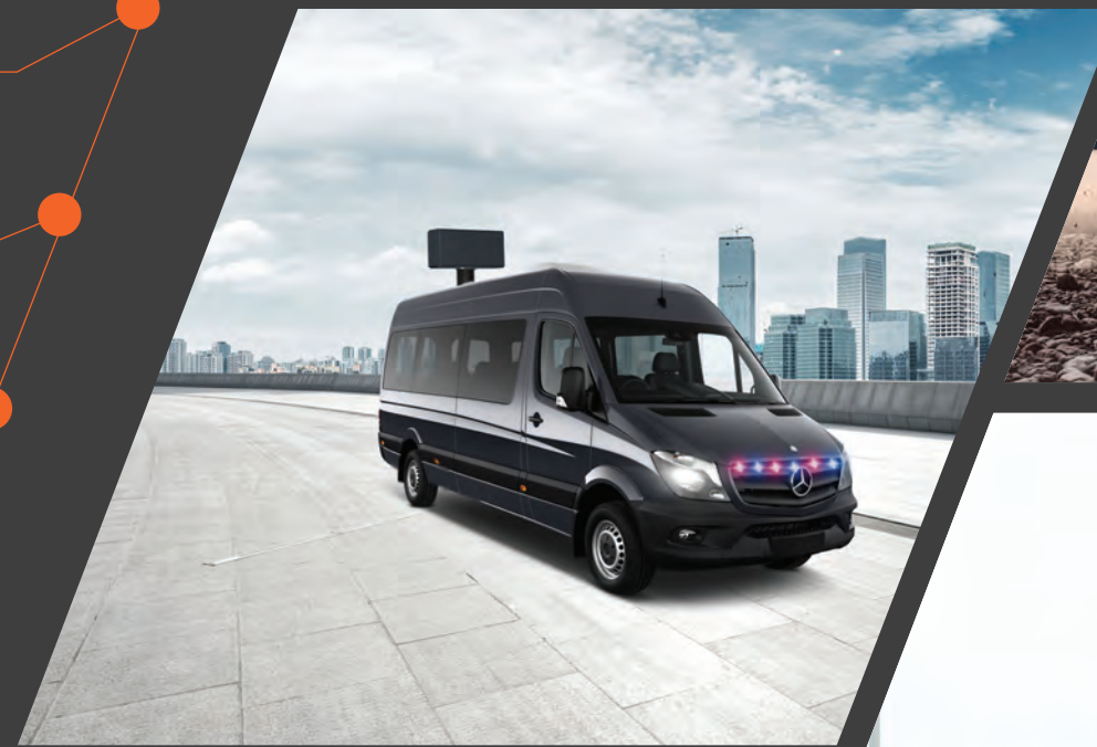
BORDER CONTROL VEHICLE