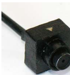
ITEM 10 Micro 1/4" CCIQ 3 Camera

Sonic Part Number CA15327/# Type B+W Sensor 1/4" CCIQ II Resolution 648 x 488 TV Lines 550 Lux Level 0.006 Lens 2.8mm lens