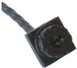
ITEM 8 Plastic bodied, slim sub micro camera

Sonic Part Number CA15324/# Type B+W Sensor 1/4" CCIQ II Resolution 648 x 488 TV Lines 400 Lux Level 0.1 Lens 3.4mm lens