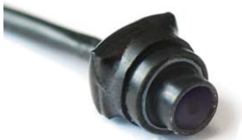
ITEM 7 Plastic bodied flat lens mono sub micro camera

Sonic Part Number CA15323/# Type Colour Sensor 1/4" CCIQ II Resolution 648 x 488 TV Lines 400 Lux Level 0.1 Lens 3.4mm lens