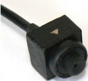
ITEM 9 Micro 1/4" CCIQ 3 Camera

Sonic Part Number CA15325/# Type Colour Sensor 1/4" CCIQ Resolution 648 x 488 TV Lines 400 Lux Level 0.6 Lens 3.9mm lens