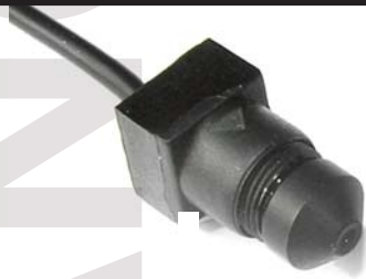
ITEM 11 Micro 1/4" CCIQ 3 Camera

Sonic Part Number CA15330/# Type Colour Sensor 1/4" CCIQ II Resolution 648 x 488 TV Lines 480 Lux Level 0.02 Lens 3.3mm lens