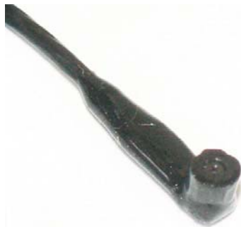
ITEM 2 Probe colour camera 90 degree view