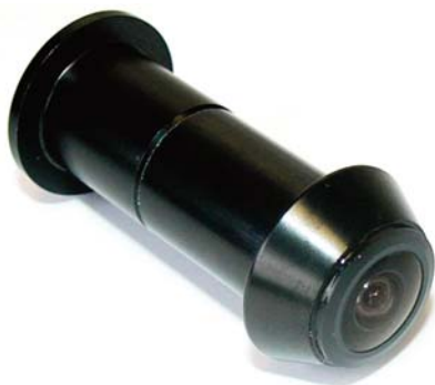
ITEM 3 Door viewer, narrow profile