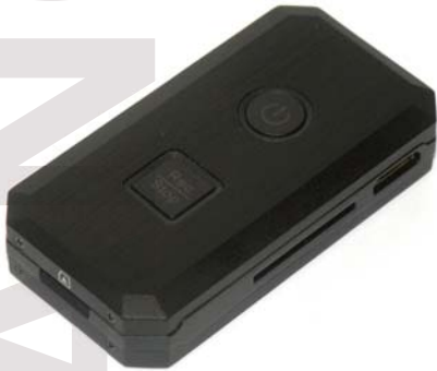
ITEM 19 PV50 DVR