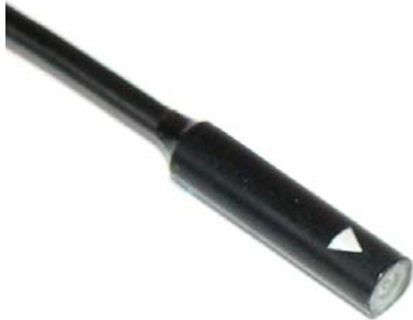
ITEM 1 Probe mono low light, wide angle camera