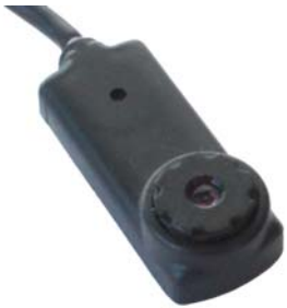
ITEM 16 Slim flat mono micro camera with audio

Sonic Part Number CA15439/# Type B+W Sensor 1/4" CCD Resolution 752 x 582 TV Lines 520 Lux Level 0.02 Lens 3.6mm lens