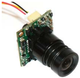
ITEM 15 Micro 1/4" CCD Hi-Res board cameras

Sonic Part Number CA15438/# Type Colour Sensor 1/4" CCD Resolution 752 x 582 TV Lines 520 Lux Level 0.02 Lens 3.6mm lens