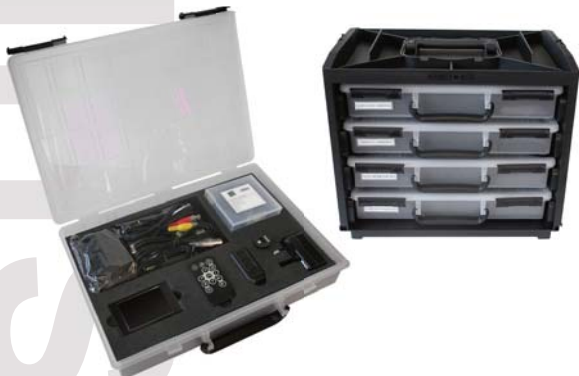
ITEM 22 DVR complete kits

Resolution 1280x960 Frame Rate 29fps Video Format MPEG-4 Memory Type Micro SD Card (Up to 32GB) Working Time 200 Minutes (Approx) Charging Time 3 hours (Approx) Connectivity Remote Control/USB 2.0 Interface Touch Screen Yes Weight 91g with Battery Dimensions 80 x 52x 22mm