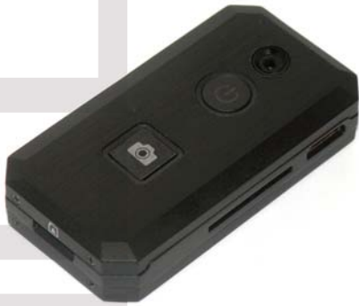
ITEM 20 PV50 HD DVR

Resolution PAL(720x576) / NTSC(720x480) Frame Rate PAL(25fps) / NTSC(30fps) Video Format H.264 / MOV Memory Type Micro SD Card (Up to 32GB) Vibration Alert On/Off Working Time 90-100 Minutes (Approx) Charging Time 3 hours (Approx) Connectivity Remote Control/USB 2.0 Interface Weight 48g Dimensions 73.5 x 39 x 15mm