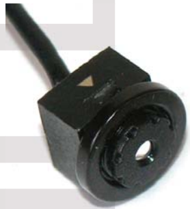
ITEM 4 Metal cased micro pinhole camera. Flat lens profile