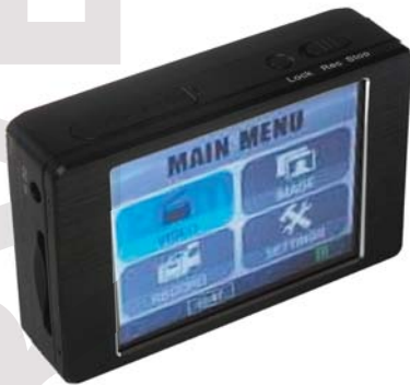
ITEM 21 PV500 II EVO DVR

Resolution 1280x960 Frame Rate 29fps Video Format MPEG-4 Memory Type Micro SD Card (Up to 16GB) Vibration Alert On/Off/Record/Photo Working Time 90-100 Minutes (Approx) Charging Time 3 hours (Approx) Connectivity Remote Control/USB 2.0 Interface Dimensions 73.5 x 39 x 15mm