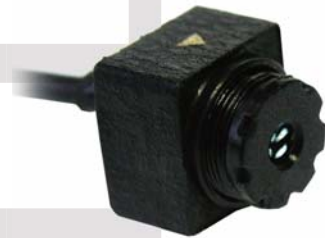
ITEM 12 Plastic bodied flat pinhole sub micro colour camera

Sonic Part Number CA15336/# Type B+W Sensor 1/4" CCIQ II Resolution 648 x 488 TV Lines 550 Lux Level 0.006 Lens 3.3mm lens