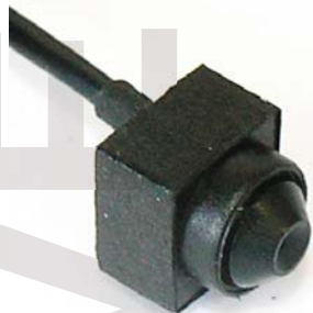
ITEM 13 Micro 1/4" CCIQ 3 Camera

Sonic Part Number CA15334/# Type B+W Sensor 1/4" CCIQ II Resolution 648 x 488 TV Lines 550 Lux Level 0.006 Lens 3.9mm lens