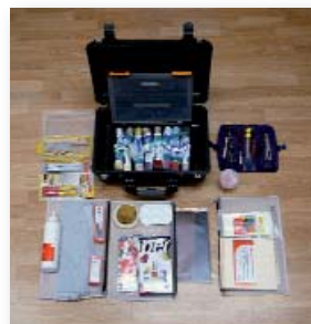
Camouflage & Concealment