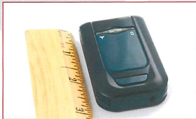
FSN Geo1 Covert Tracker and Sizing Ruler