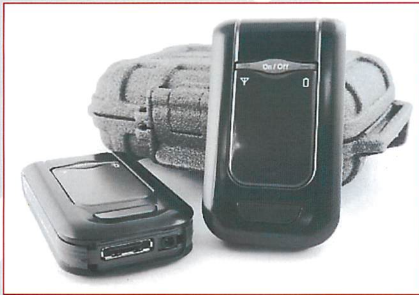
FSN Geo1 Covert Tracker and 'Slap & Track' 1000 Magnetic Case

The FSN Geo1, powered by Qualcomm inGeo™ platform, is a small, value-priced, tracking and monitoring device. The inGeo-enabled unit along with FSNtracks web-based service provides an end-to-end solution for dedicated consumer and enterprise-class covert and embedded tracking applications. Based on gpsOne™ assisted location-position technology, the FSN Geo1 tracker operates in impaired environments with no clear view of the sky. Examples include inside buildings, embedded in high-value cargo, and hidden under vehicles. Superior battery management sets the FSN Geo1 apart. The inGeo platform operates on Qualcomm patented "Low Duty Cycle" technology which provides unique hibernation capability that produces best-in-class operation and standby time.