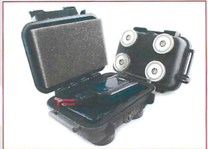
FSN Geo1 Covert Tracker with 10,600 mAh Li-Polymer Extended Battery and Model 1010 Magnetic Case